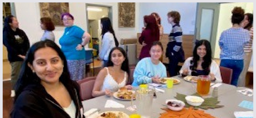
2023 St. Andrew's Hall Thanksgiving service and dinner