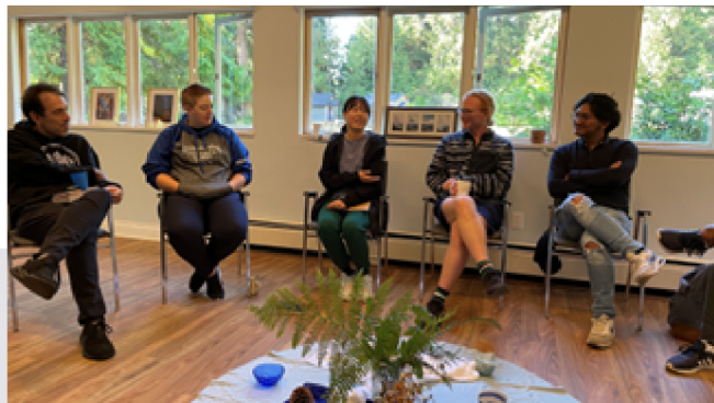
Presbyterian VST students on retreat at Camp Douglas