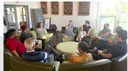
2023 Guder Scholars and public lecture